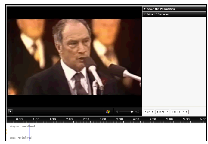
Early days of our licensed video streaming collection

We found that one of the biggest challenges of creating your own video content is the editing process. We rely heavily on the expertise of