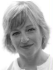
Rita Vine - 909 Cool Search Site... Or Something Else? How to Evaluate Web Search Tools