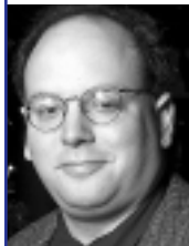
Gary Price - 211 Tools for Managing Online Information 417 Web Collection Development