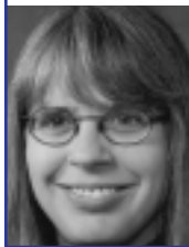
Darlene Fichter - 205 Always Fresh: Fast Content for Your Web Site with Real Simple Syndication (RSS) 515 Designing for Scent: Why Stinky Sites Work