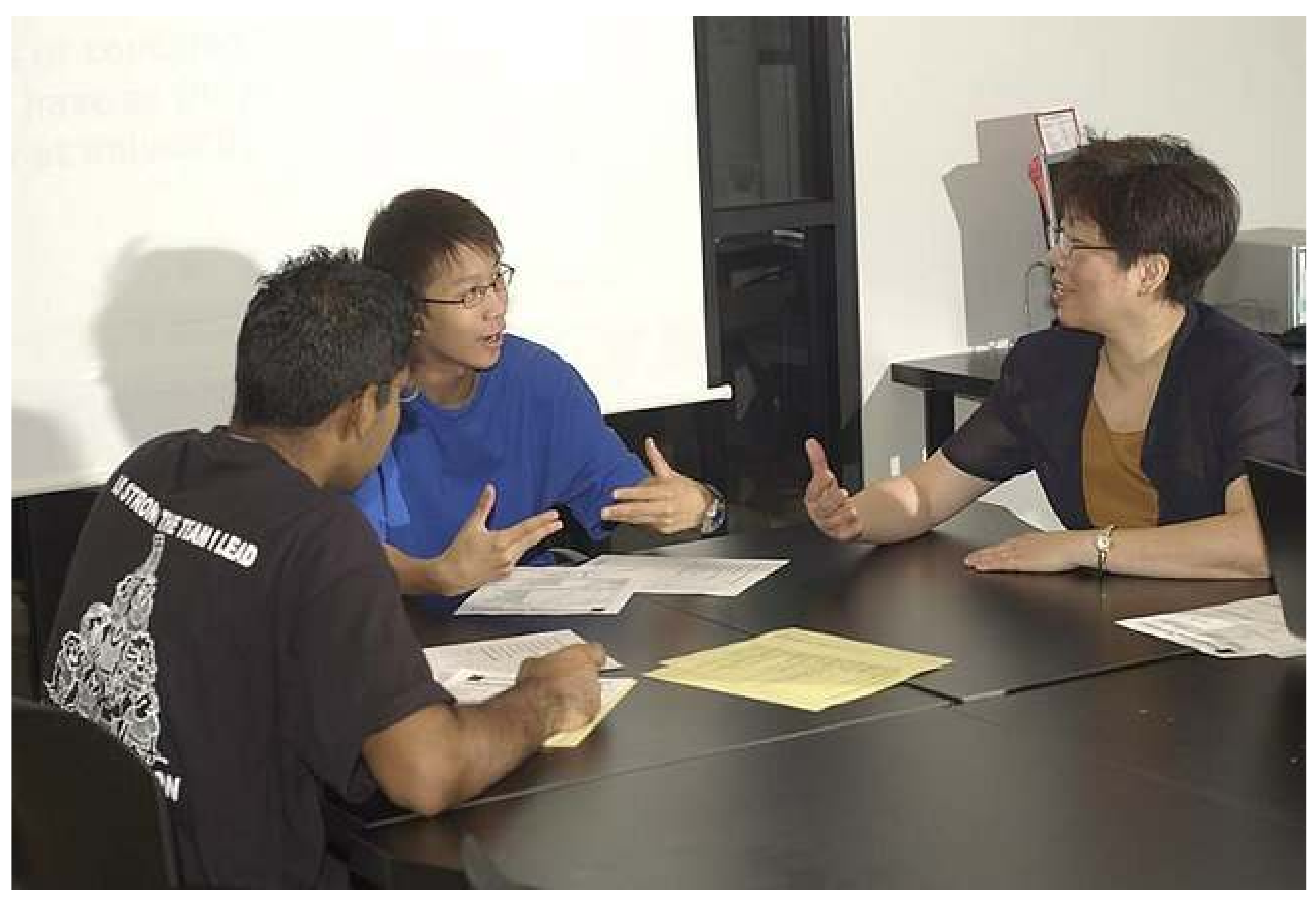
31 January 2008 OLA Super Conference #607