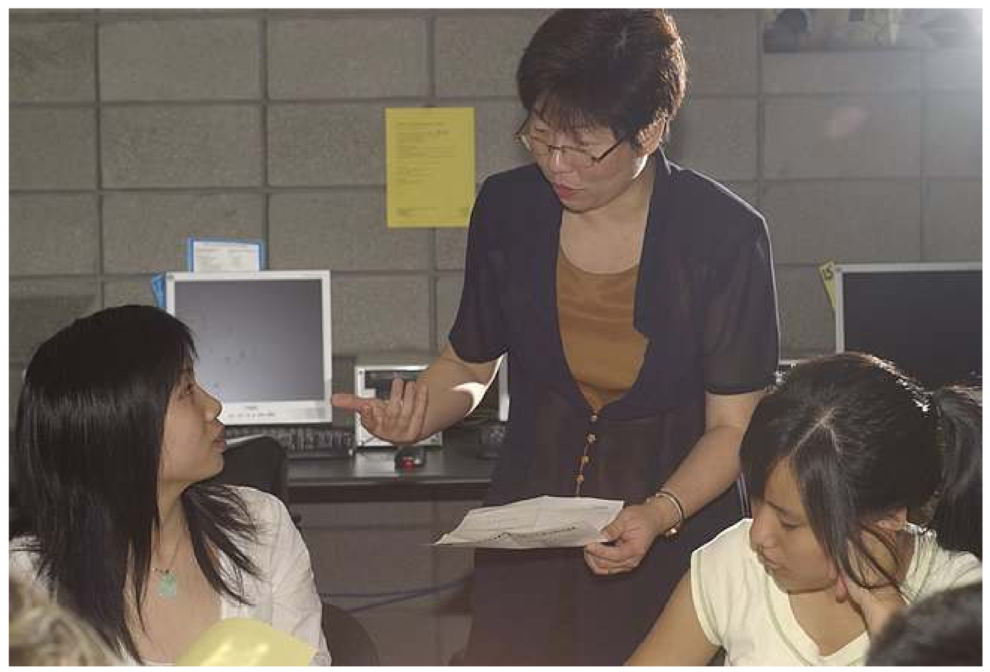
31 January 2008 OLA Super Conference #607