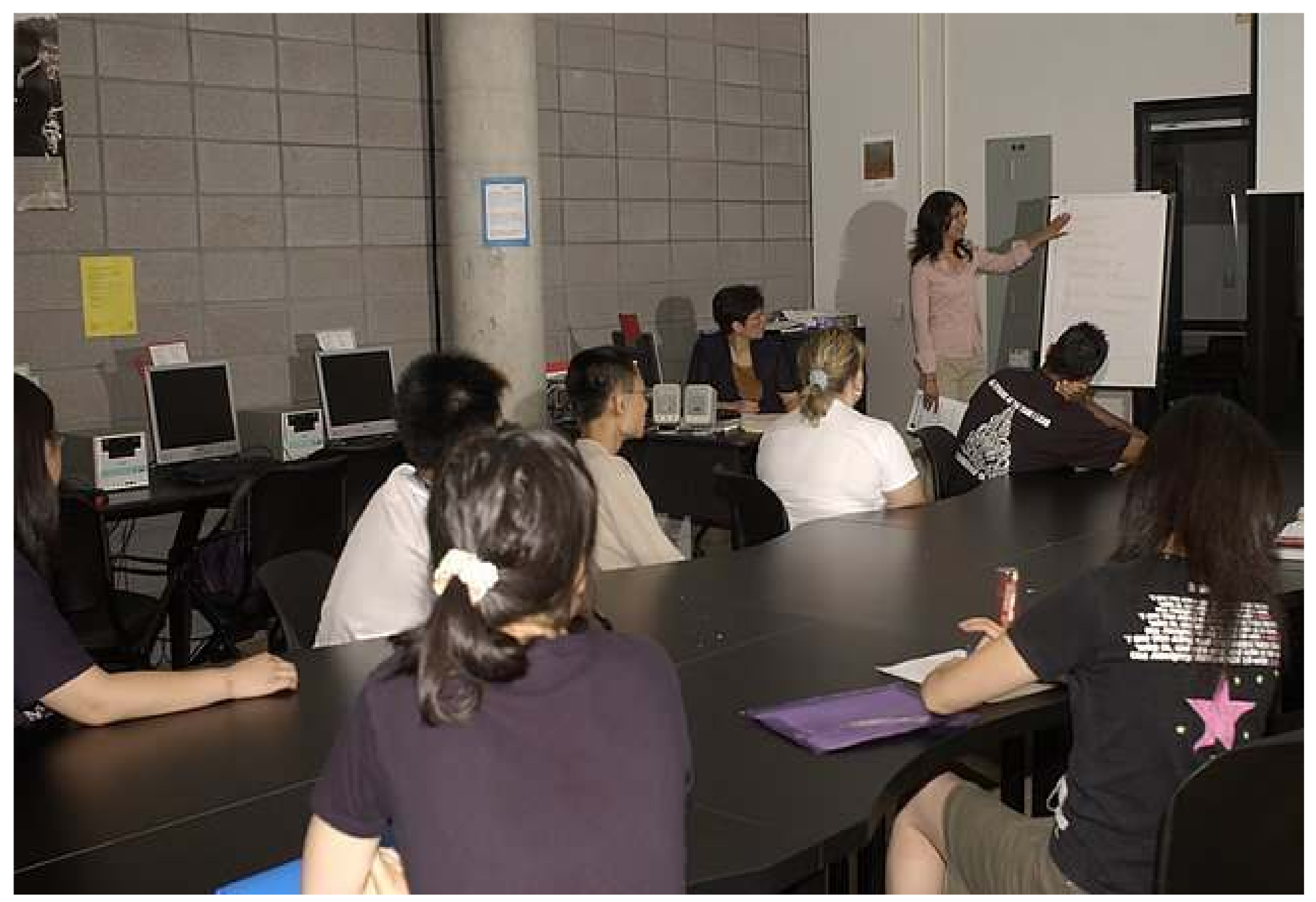
31 January 2008 OLA Super Conference #607