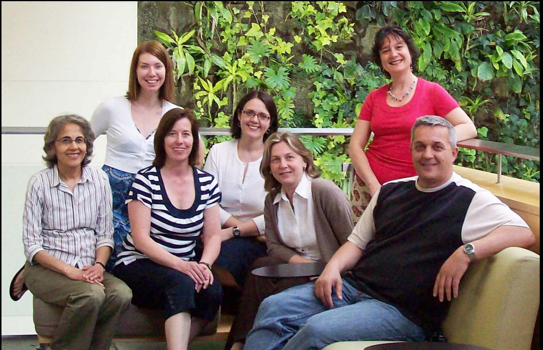
Library Services Team