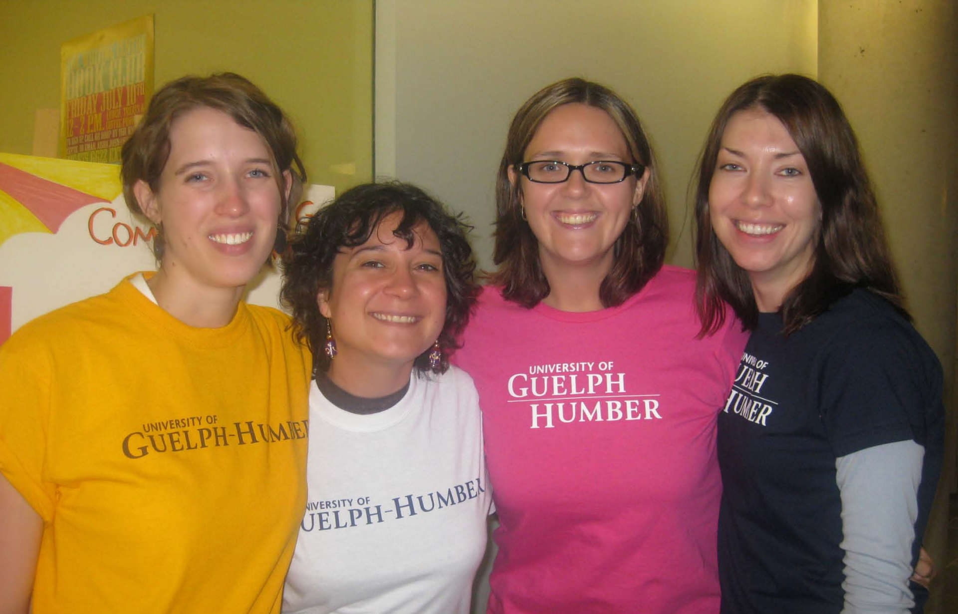
Learning Commons Fair