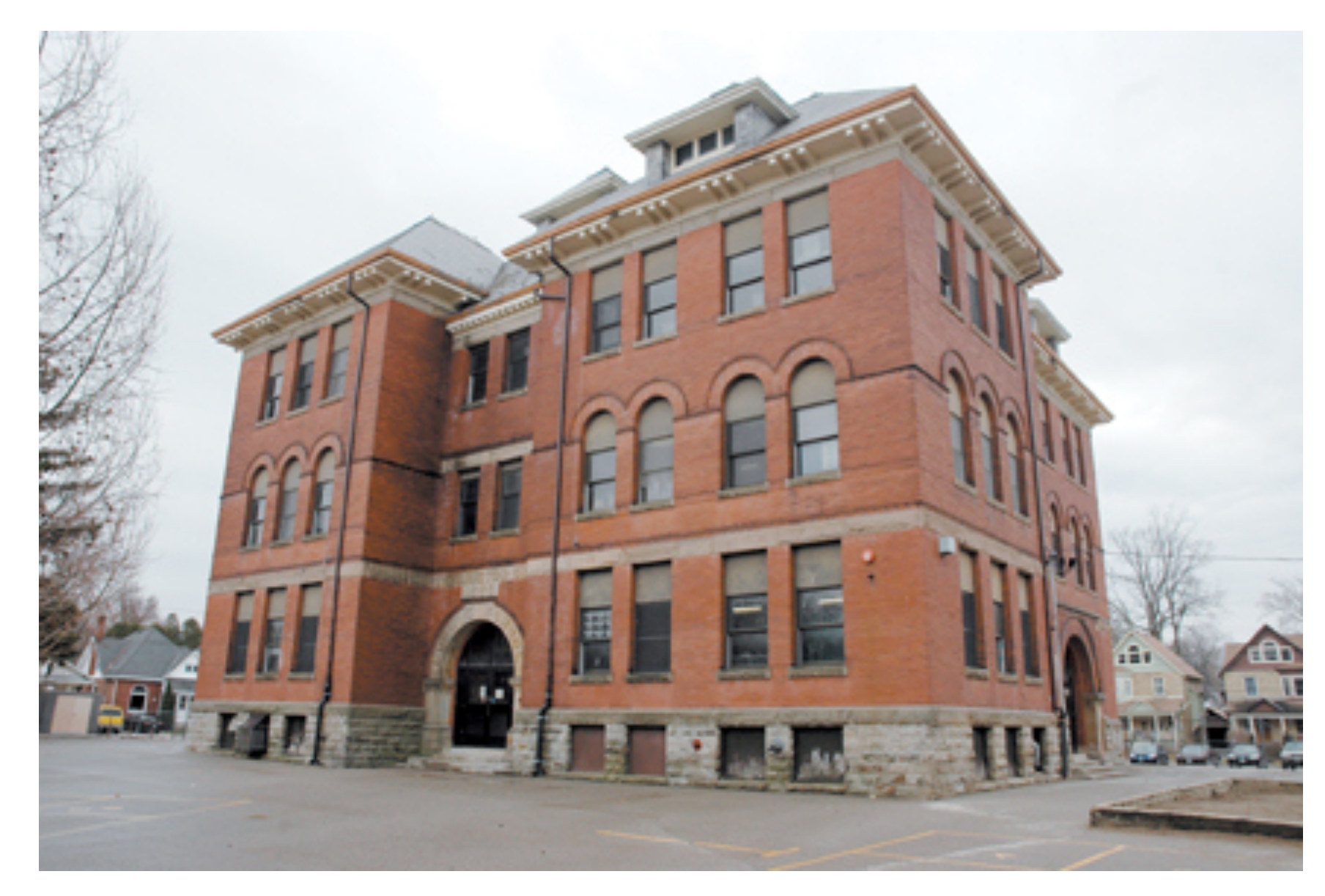
50 Wellington Street, St. Thomas