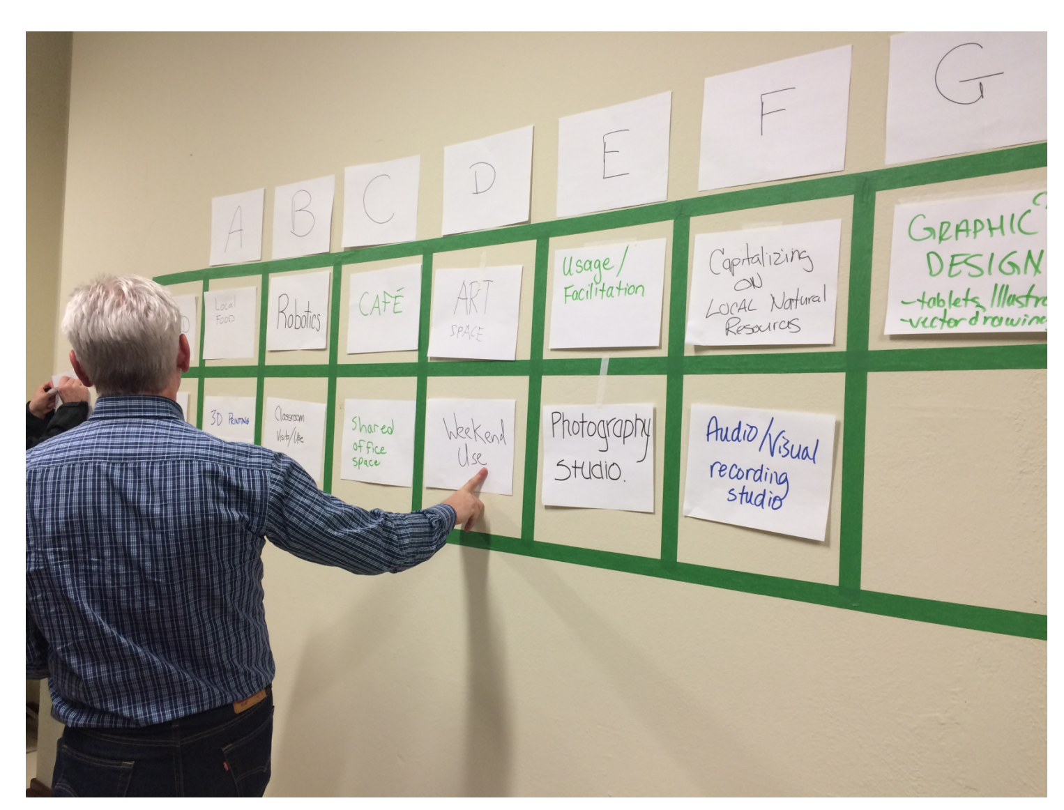
Public Consultation Agenda