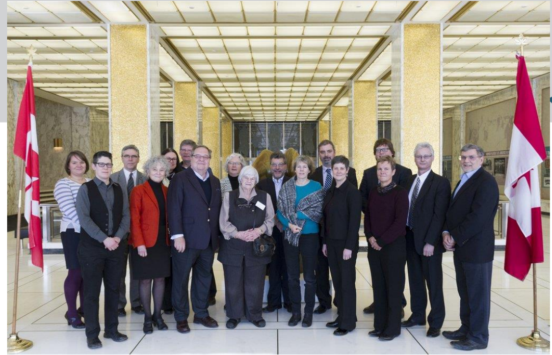
Acquisitions Advisory Committee, Jan 2016