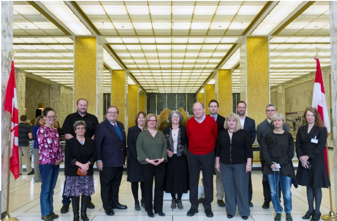
Services Advisory Committee, Dec 2016

Informs direction and priorities for public services, digitization, exhibition plans, and major projects